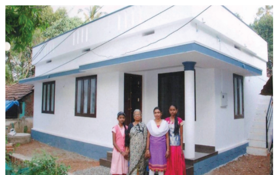
BLC House, Tamilnadu