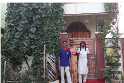
BLC house with kitchen garden, Guntur, Andhra Pradesh

The Secretary, MoHUA assured that sufficient funding for PMAY (U)-CLSS is available. He also highlighted that an arrangement of Rs 60000 cores under National Urban Housing Fund (NUHF) has been provided as Extra Budgetary Resources (EBR) especially for PMAY (U) in addition to the budgetary grants to meet the housing demand. The Secretary, MoHUA further urged the bankers to proactively come forward in helping the potential beneficiaries realize their dream of having a house of their own.