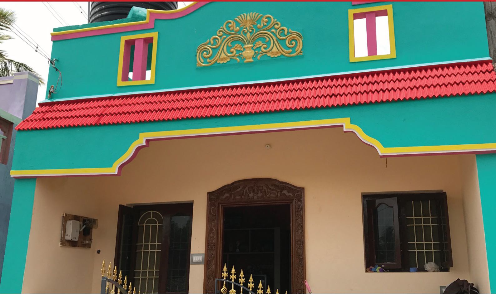
R.BABY, KAARAI, RANIPET, TAMIL NADU